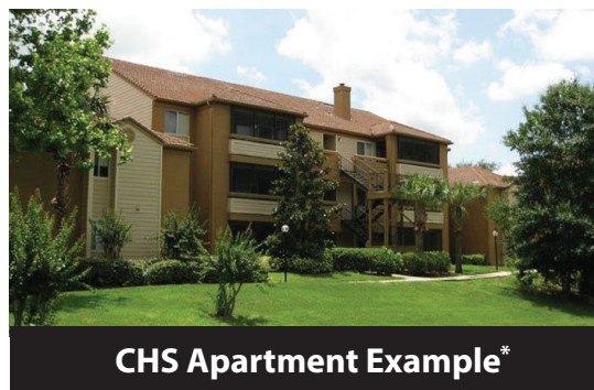
CHS Apartment Example*

Complete Your Application Online Or Contact A CHS Housing Representative Today! 1-800-866-8346