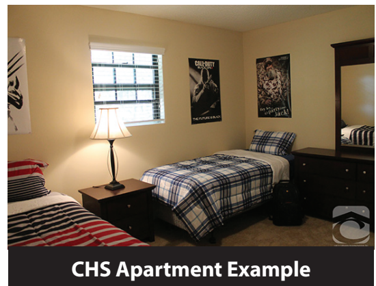
CHS Apartment Example

www.housingservices.com/northwest-lineman-college/denton-tx/