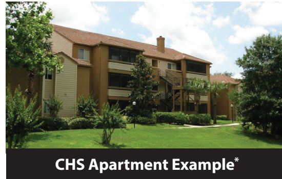
CHS Apartment Example*