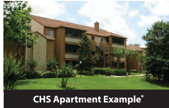
CHS Apartment Example*