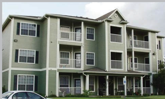
CHS Apartment Example