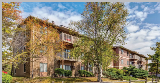
CHS Apartment Example

Clubhouse with game room and big screen TVs, swimming pool, on-site courtesy officers, fitness center, basketball, volleyball and tennis courts.