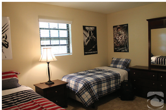
CHS Apartment Example

Or Contact A CHS Housing Consultant Today! 1-800-866-8346