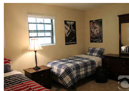
CHS Apartment Example*

Complete Your Application Online Or Contact A CHS Housing Consultant Today!