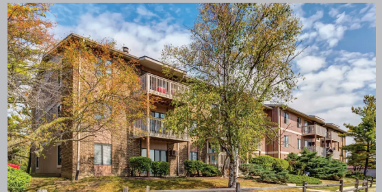
CHS Apartment Example

Clubhouse with game room and big screen TVs, swimming pool, on-site courtesy officers, fitness center, basketball, volleyball and tennis courts.