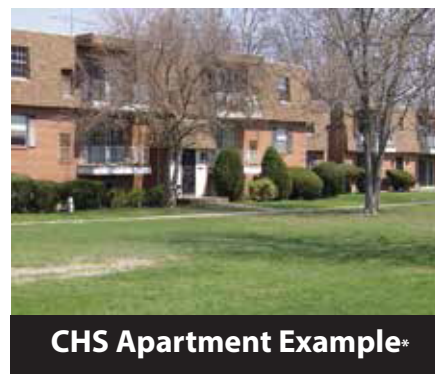
CHS Apartment Example*