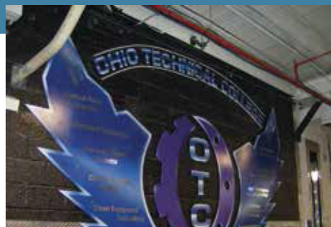
Ohio Technical College Campus

Clubhouse with game room and big screen TV's, swimming pool, on-site courtesy officers, fitness center, basketball, volleyball and tennis courts.